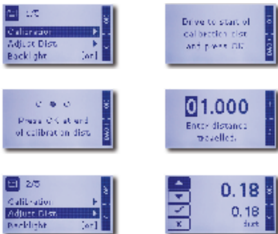
Sample User Interface Menus

With its modern design, simple operation, and low cost we are confident that the new Q-Series will prove to be very popular among club competitors.